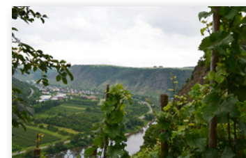
View of nearby River Mosel

9:00 SESSION 22 Omissions and Errata Béland 10:30 BREAK MEETING ADJOURNED