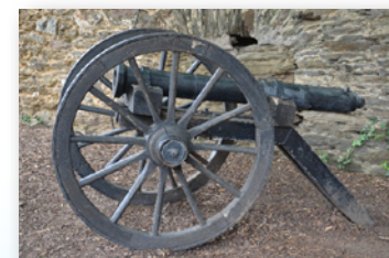
Canon in Schloss Rheinfels courtyard